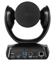
DIP switch HDMI out USB 3.1 type-B LAN for IP streaming and Power over Ethernet (PoE) DC 12V RS232 in/out