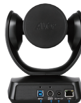
USB 3.1 type-B RS232 in/out LAN for IP streaming/ remote access DC 12V