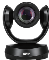
H182 x W142.7 x D153 mm