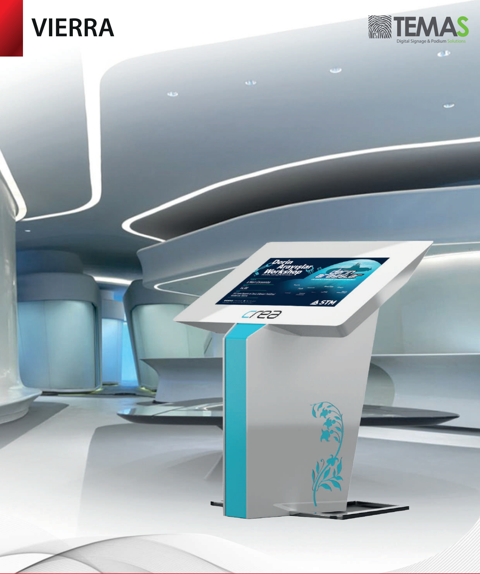
Interactive Touch Screen Kiosk